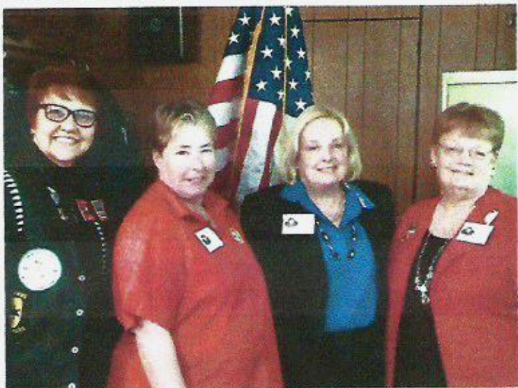
Department Membership Caravan